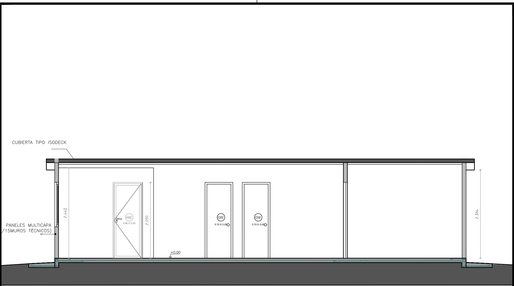
CORTE A - A ESCALA_ 1/50